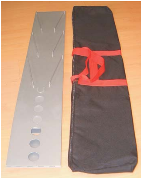
kit includes: slope frame & carry case