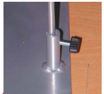
Locate support pole into base and tighten thumbwheel to secure